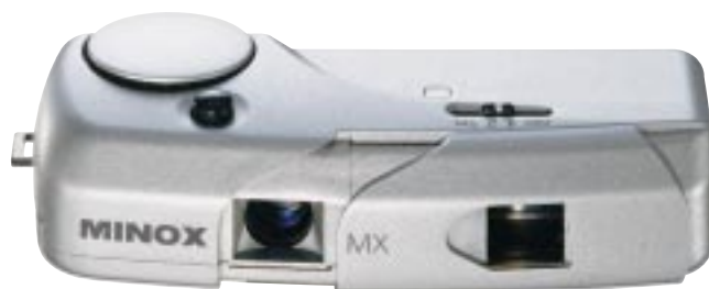
MINOX MX (1:1)