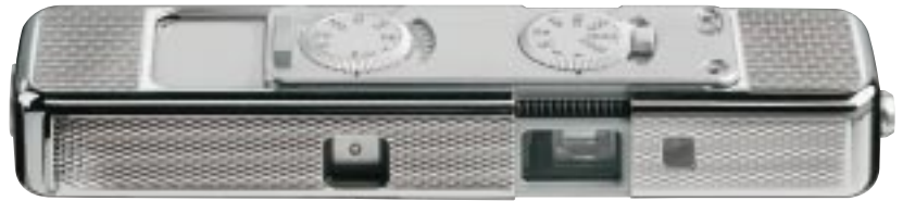
MINOX CLX (1:1)