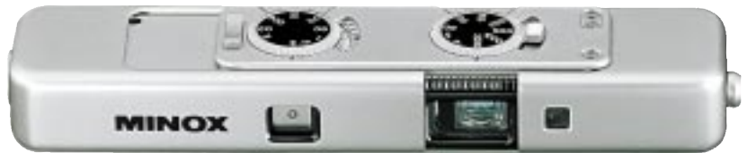
MINOX TLX (1:1)