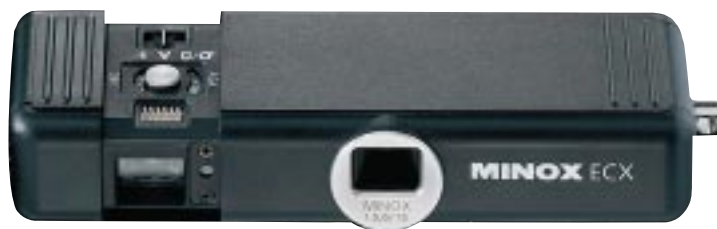
MINOX ECX (1:1)