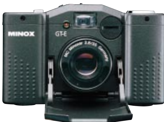
MINOX GT-E (new)