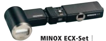
MINOX ECX-Set incl. flash, batteries and film Order number 60525